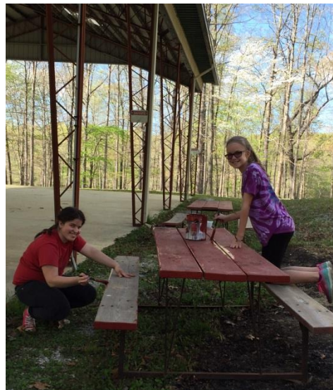
Picnic Tables – New Paint