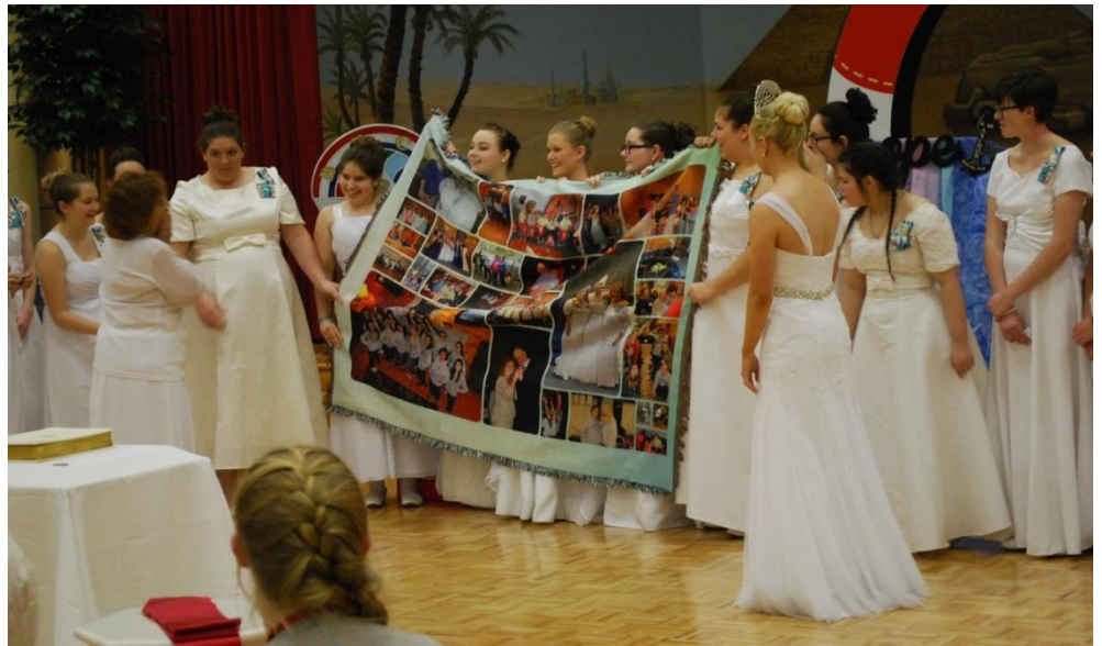
Mom Gail received a blanket with photos of all the Grand Officers.