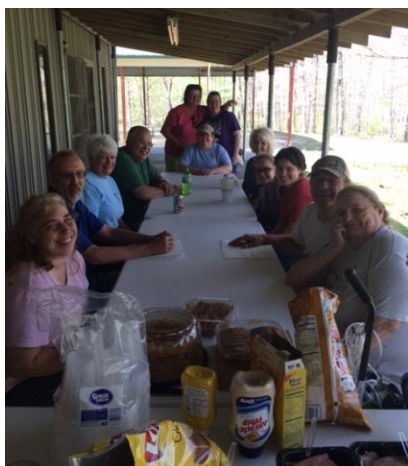
And of course, FOOD